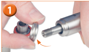
Stop ring chamfer

The parf super dog can be assembled in three configurations.