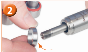
Cap spacer for completely flush