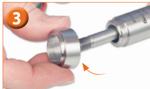
25mm Mid bush register